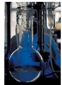
Parts per trillion detection for precise biomedical and pharmaceutical research.