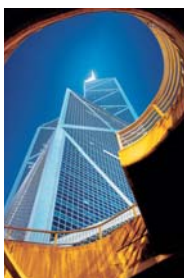
Indoor air quality control requires NO 2 monitoring.

The CLD 66 is the most compact unit of its class. Thanks to the totally modular layout and integrated ozone generator and scrubber it is designed for a multitude of applications.