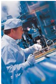
Clean room laboratories require reliable and precise gas analysis.

The new CLD 66 nitrogen oxide analyzer is the economical solution for the continuous measurement of NO, NO 2 and NO x concentrations even in the range of parts per trillion!