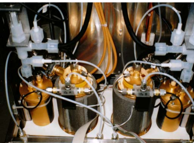
CLD 790 SR: A Golden Standard. Reaction chambers.