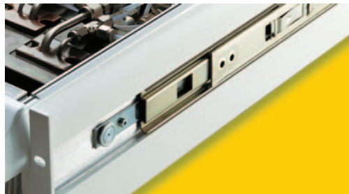
The CLD 844 CM h with slides is perfectly prepared for rack mounting.

Naturally occurring pressure variations in the sample flow are balanced out by means of an electronic and