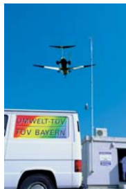
Monitoring of ambient air quality.

The CLD 88 p nitrogen oxide analyzer is unique in its precision. It allows with the PLC 860 the sequential measurement of NO and NO 2 concentrations even in the range of parts per trillion!