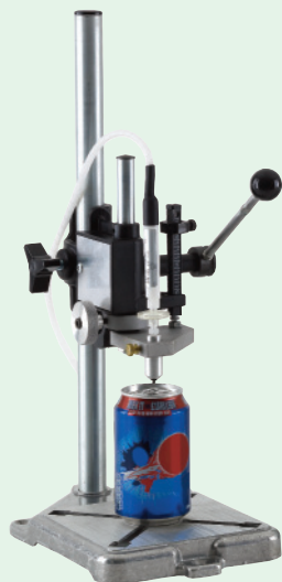
Can Piercing Station

The next generation Gaspace Advance from Systech Instruments. Fast, accurate and simple to use yet full of the most advanced features available in headspace analysis.